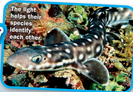
The light helps their species identify each other.

Catsharks have something called biofluorescence, where light is produced by the shark itself — but humans aren't able to see it with the naked eye. Researchers have created a camera that replicates the same light, so they're able to see the sharks in the dark depths of the ocean. This will help them better study the sharks' communication and living habits!