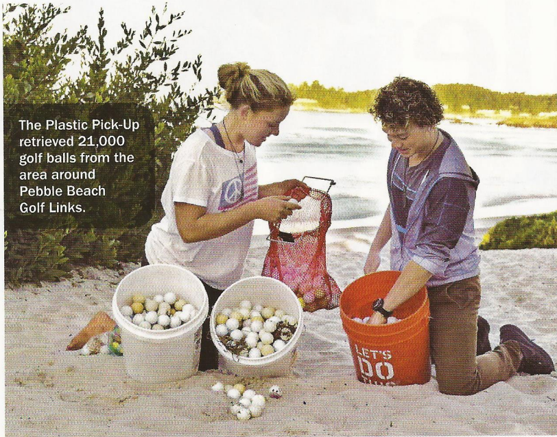
The Plastic Pick-Up retrieved 21,000 golf balls from the area around Pebble Beach Golf Links.